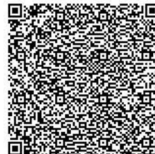
Course : Bythewayfield